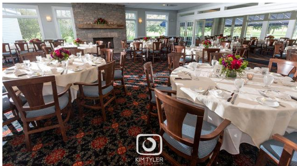
The Main Dining Room at Clinton Country Club

Commodore's Welcome We hope you can join us for this end of season celebration. It's been a great year and now it is time to celebrate our friendships. This will follow the format used last time with only a handful of perpetual trophies awarded. All others will be available for pick up at the event but we will not be announcing. Mail your Reservation by October 27 th to DIYC, P.O. Box 593 Westbrook, CT 06498.