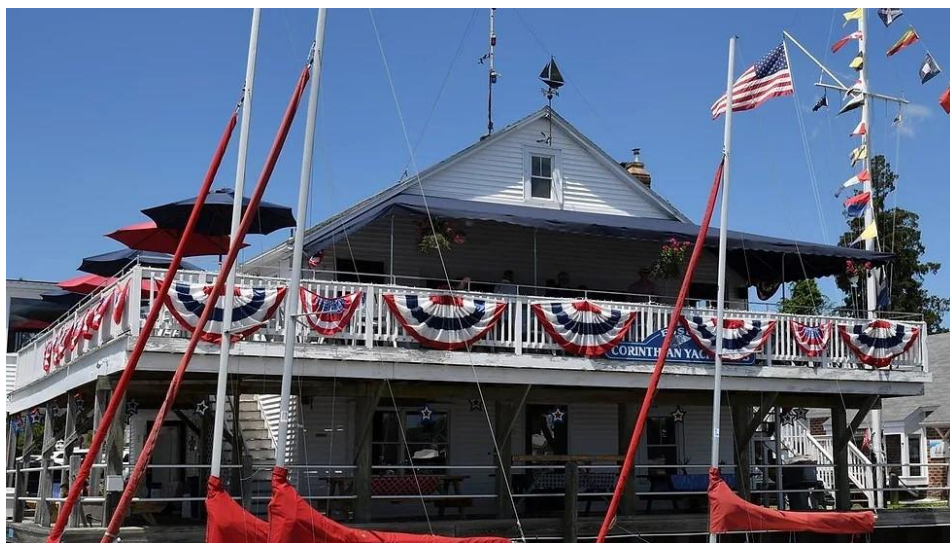
Essex Corinthian Yacht Club