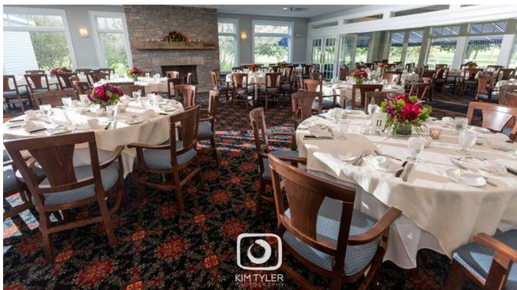
The Main Dining Room at Clinton Country Club

Commodore's Welcome We hope you can join us for this end of season celebration. It's been a great year and now it is time to celebrate our friendships. This will follow the format used last time with only a handful of perpetual trophies awarded. All others will be available for pick up at the event but we will not be announcing. Mail your Reservation by October 27 th to DIYC, P.O. Box 593 Westbrook, CT 06498.